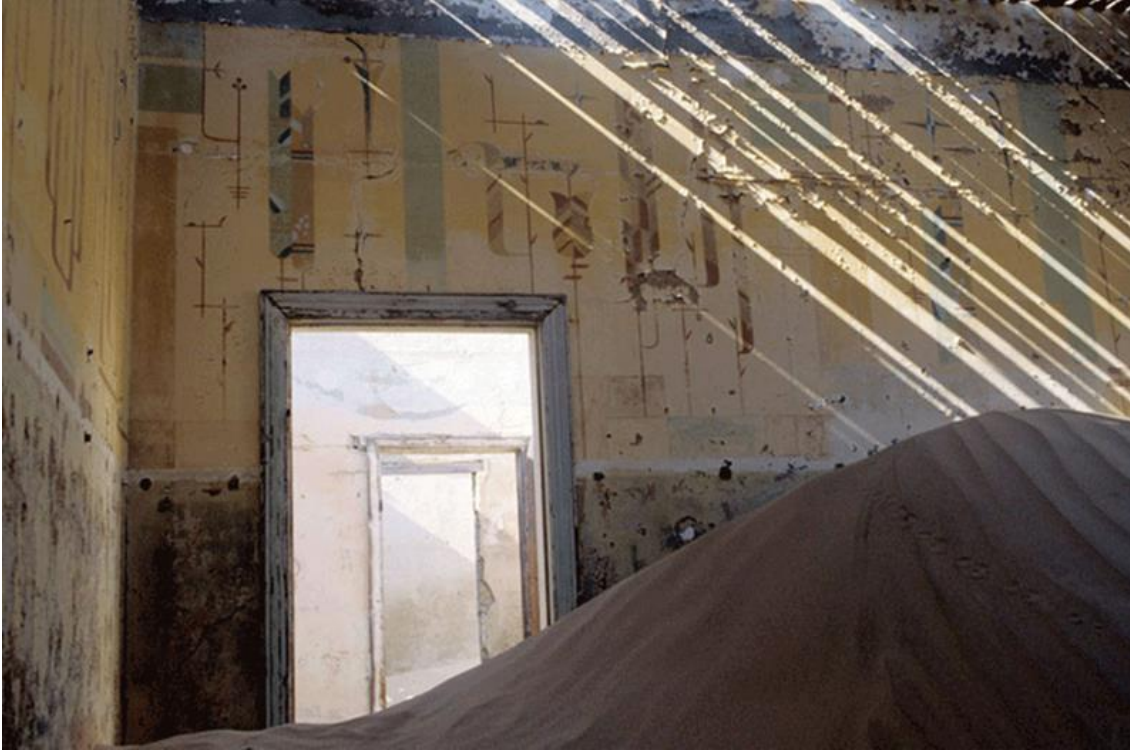
Abbildung 1: Kolmanskuppe, Namibia

“[...] an antenna on the roof, a telephone wire through the wall, a television set instead of a window, and a garage with a car instead of a door. The formerly intact house has become a ruin, and through the cracks blows the wind of communication. [...] A new architecture, a new design is required.” 2