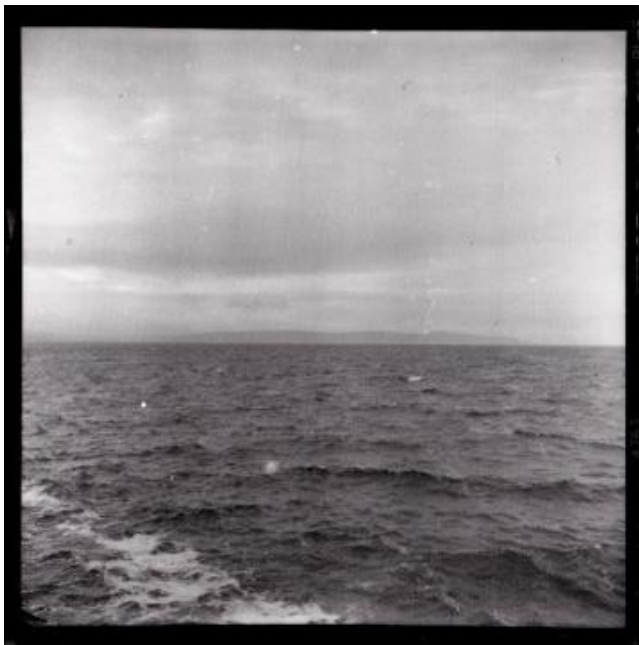
Figure 2 Gelatin silver photograph of Galway Bay, North Atlantic Ocean

This quarry was potentially abandoned because all reachable and/or profitable minerals and ores had been extracted, though the cause is unknown to the photographer. 2 A likely material extracted from this quarry—or if not here, from similar quarries worldwide—is quartzite, an abundant rock found just beneath the Earth’s surface. Quarries and mines around the world also extract silver, primarily as a by-product of mining lead, copper, zinc, and gold ores. These same ores provide essential materials for batteries, electronics, electrical wiring, and corrosion-resistant components in modern technology, while silver plays a crucial role in film photography.