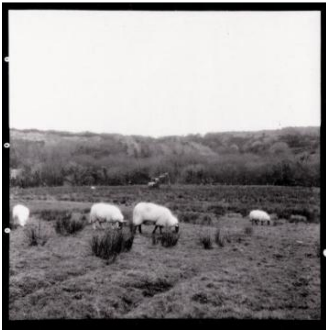
Figure 3 Gelatin silver photograph of sheep grazing, Connemara

in diverse culinary applications but is also an indispensable substance in film photography, where it binds silver halide crystals to the film base.