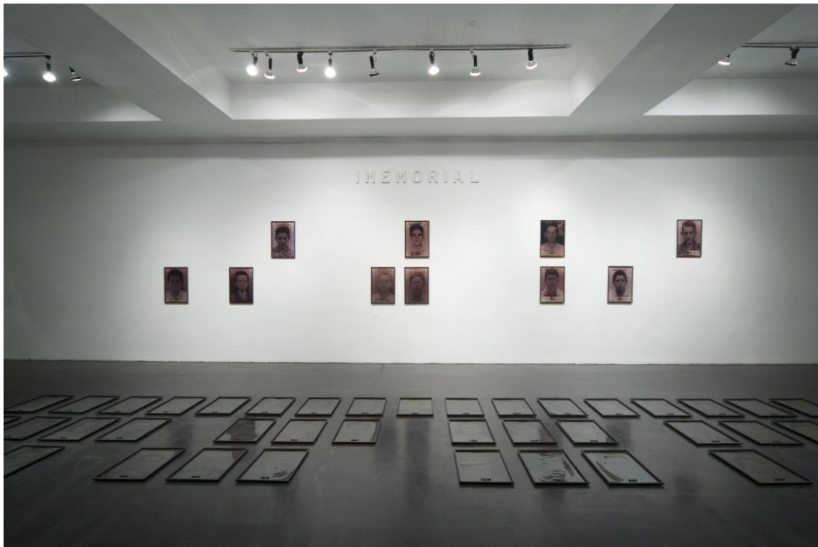
Rosângela Rennó, Imemorial (1994), installation for the exhibition Reverendo Brasília , Galeria Athos Bulcão, Brasília, 40 black-painted orthochromatic film prints, 10 colour prints, 60 x 40 x 2 cm (each iron frame).

A series of fifty manipulated photographs appropriated from the Public Archive of the Federal District in Brazil is the subject of Rennó's installation Imemorial [Immemorial]. The work was created for the group exhibition Reverendo Brasília [Relooking at Brasília] in 1994. Organized by the Goethe Institute Brasília and the Fundação Athos Bulcão, the exhibition was held in the Galeria Athos Bulcão, Teatro Nacional (Brasília) from 1 st to the 25 th September, 1994. It travelled to São Paulo, Rio de Janeiro, Curitiba, Porto Alegre and Belo Horizonte between October 1994 and May 1995.