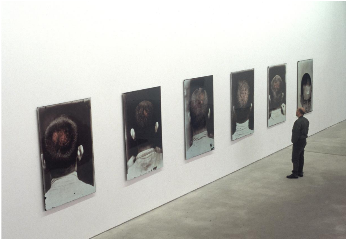
Rosângela Rennó, detail of the installation

Emphasizing the uniqueness of each cowlick, Rennó introduces the idea of individuality into an anonymous public sphere. “More than being a number”, she pointed out, “the prisoners are individuals” (Herzog 2002: 88), and their cowlicks mark the difference between each one. The body of anonymous prisoners, originally identified by numbers, is, thus, opposed to the individualizing attributes of the single cowlicks. Manipulating these images and emphasizing their unique characteristics, Rennó provokes the viewer to think again about the institutional uses of photography. After the manipulation of the artist the image of the back of the head of an anonymous prisoner can suddenly be looked at again, representing now the identity of a human being that, like any of us, has unique characteristics, like a cowlick or a fingerprint.