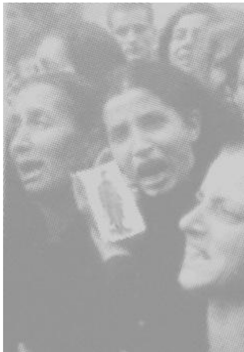
Rosângela Rennó, from the series Bodies of Soul , Napoles, (photo Robert Capa/Magnum Photos),

The work Corpos da Alma [Bodies of Soul] is composed of digital images made from appropriated photographs published in newspapers between 1990 and 2006. The images consist of people holding photographs of loved ones who have presumably disappeared due to wars, terrorism or urban violence and are most likely already dead. Rennó manipulated the photographs, creating images constituted by dots – in grey or in color – making a direct reference to low-resolution reticulated newspaper images. The work has been presented in the last four years in different formats such as engravings on stainless steel and vinyl adhesive circles placed directly on the wall. More recently Rennó has used an inkjet printer and the images are rendered in non-naturalistic colour. The more recent works from 2006-2007 are also titled: Estado do Mundo [State of the World].