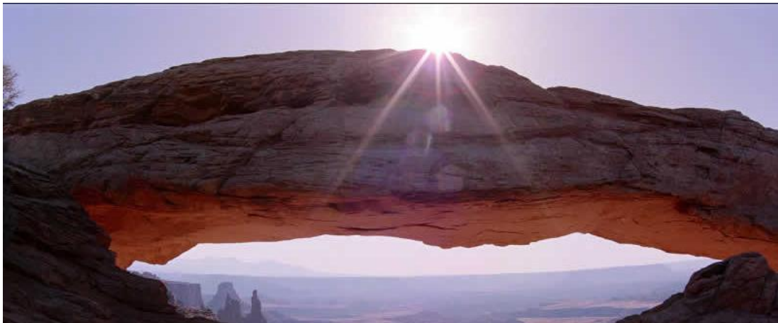
FIGURE 2: ATMOSPHERIC LANDSCAPE FROM "BARAKA"

The collection of concept-images will be constituted of atmospheric landscapes, animations and archive footage. An image research will orient the selection of this material, whose function will be to ambient the viewer in a contemplative perspective. The effect we are looking for with the combination of concept-images and our sound proposal (cf. 2.4 Montage and sound proposal) is similar to the one achieved in the film "Baraka" (1992) by Ron Fricke. Part of this collection has already been acquired in Europe, especially in southern France, where Vilém Flusser lived for 20 years and imbued himself in that scenery to develop his writings. The rest of these images will be captured after a location research performed by the technical crew during pre-production.