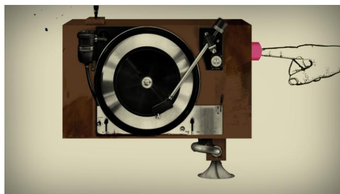
FIGURE 4: USE OF MIXED ANIMATION TECHNIQUE FROM "I MET THE WALRUS"

The 2D animations will be used to explain excerpts from the philosophical narrations of the interviewees, in order to make them more palpable. We can mention the short film "I met the Walrus" (2007) by Josh Raskin, as a reference of animation used to this effect. In the scripting process, after capturing the interviews, we will elaborate a list of animations.