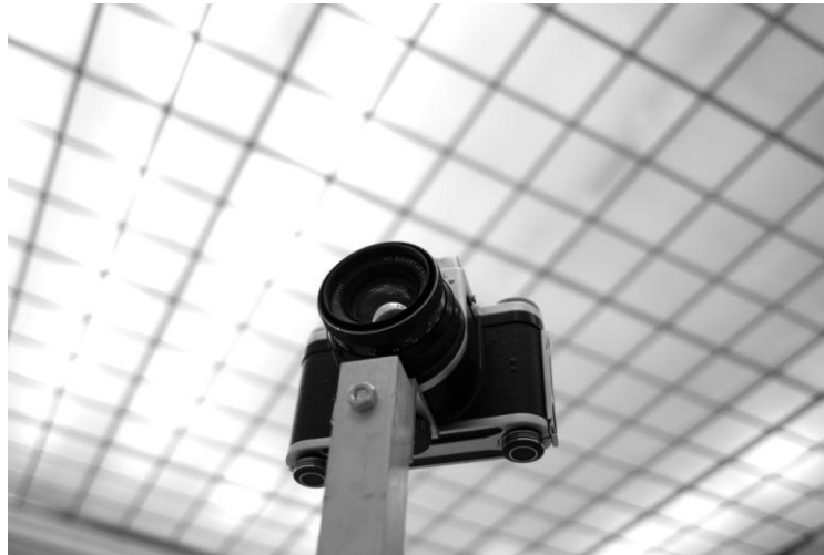
FIGURE 3: FLUSSER'S PHILOSOPHY OF PHOTOGRAPHY PRESENTS A CRITICAL APPROACH TO THE WAY WE PRODUCE IMAGES

Photographic gesture: A gesture of hunting, where the photographer and the camera unite to become a single, indivisible function. The gesture seeks new situations, never before seen; it seeks what is improbable; it seeks information. The structure of the gesture is quantal: it is one of doubt composed of point-like hesitations and point-like decisions. It is a typically post-industrial gesture: it is post-ideological and programmed, and it takes information to be "real" in itself, and not the meaning of that information.