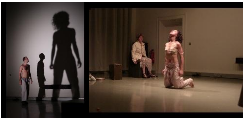
FIGURE 6: SCENES FROM THE PLAY "BODENLOS" AT THE FLUSSER ARCHIVE

As for the biographical elements, some of these have already been captured in Europe (Czech Republic, Hungary, Germany and France). Among the images collected, we can highlight shots from Prague, from his house in Robion, in southern France, as well as the presentation of the play "Bodenlos – Without Ground" in Prague and Berlin, performed by the Brazilian theatre company Grupo de Teatro da Poli. Moreover, we were given access to the full content of the video archives of the Flusser Archive at the Universität der Künste in Berlin.